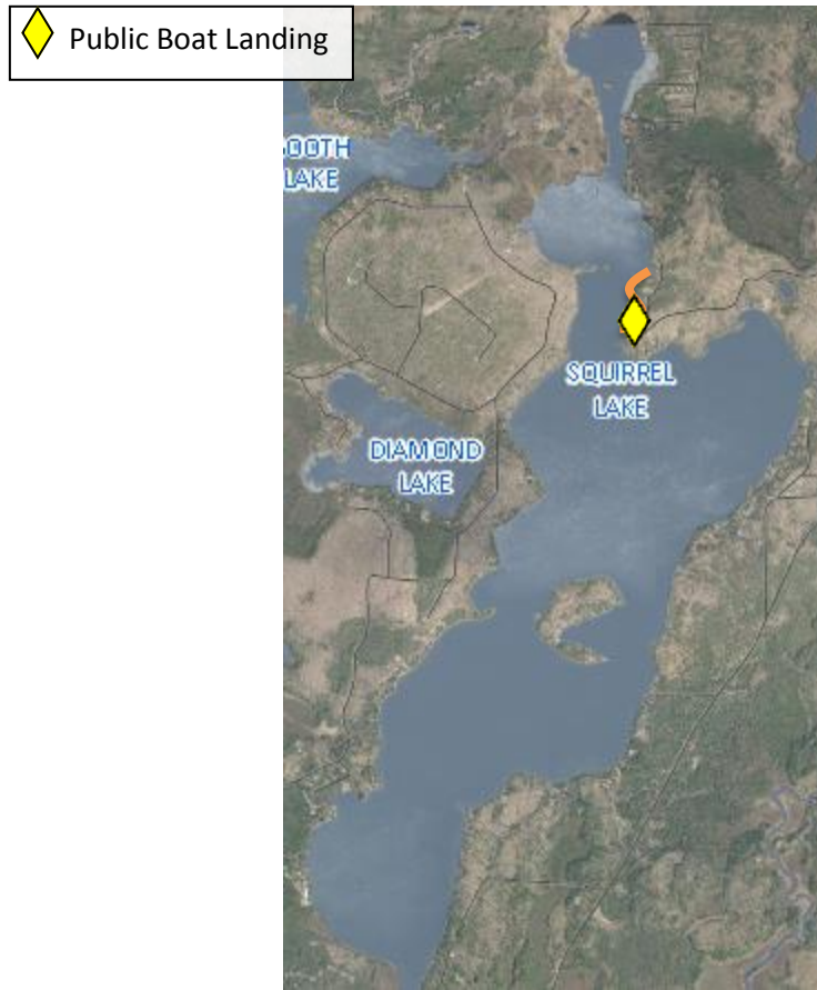
Figure 1. Map of Chain Lake with the public boat landing labeled. The orange line shows the part of the shoreline that was monitored.