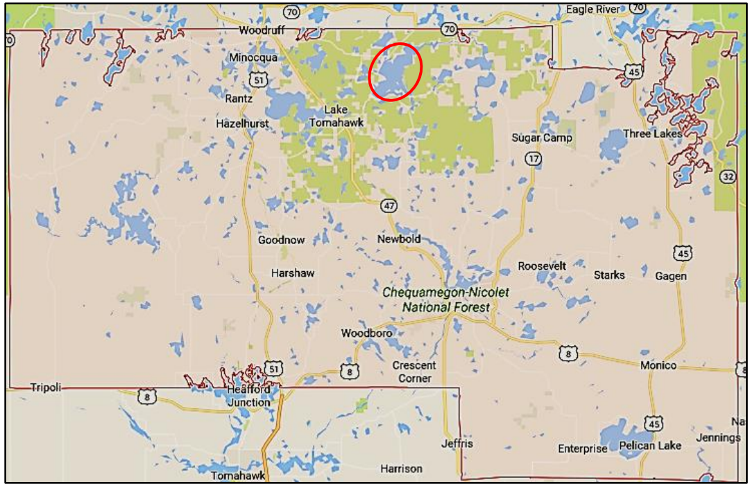
Figure 2. Map of Oneida County, WI with the approximate location of the Rainbow Flowage circled in red.