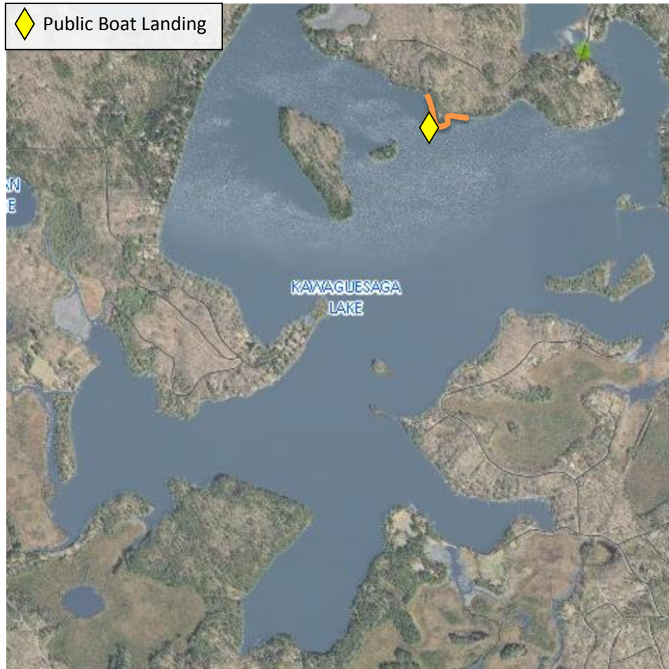
Figure 1. Map of Kawaguesaga Lake with the public boat landing labeled. The orange line shows the part of the shoreline that was monitored.