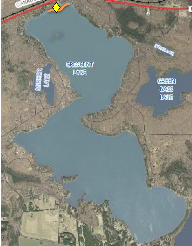
Figure 1. Map of Crescent Lake with the public boat landing labeled. The orange line shows the part of the shoreline that was monitored.