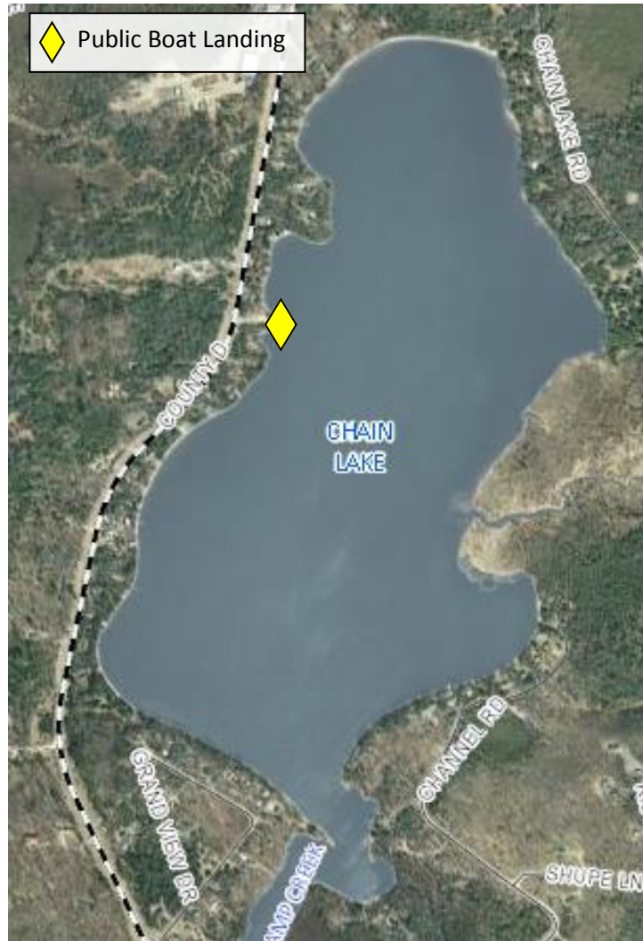
Figure 1. Map of Chain Lake with the public boat landing labeled.