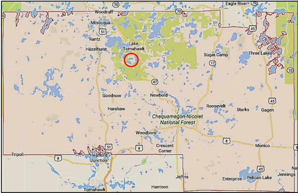
Figure 2. Map of Oneida County, WI with Big Carr Lake's approximate location circled in red.