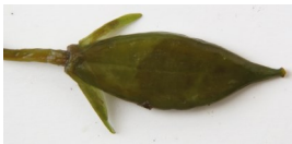
Fruits are flattened, pointed at one end, and about 1 inch long.

Dispersal Vectors: Native to Europe and Asia, yellow floating heart was introduced to North America as an ornamental plant for water gardens. Water gardeners probably released excess plants into local waterways, or the seeds may have been carried to local waters by animals. Yellow floating heart can spread by fragments of the rhizomes or stolons, and by seed. Seeds have a fringe of tiny hairs that allow the seeds to float and cling to animal fur. Nursery shipments of yellow floating heart have been found to contain seeds and fragments of additional invasive species, including Hydrilla.