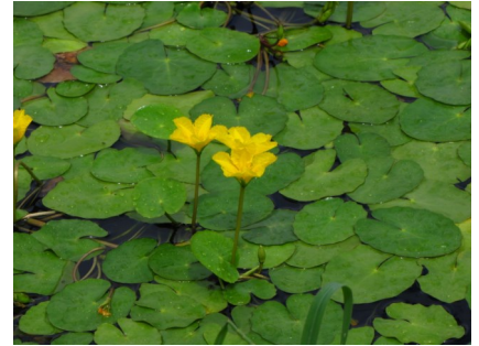
Yellow floating heart has small, floating leaves and yellow flowers held on long stalks.

Description: Yellow floating heart is a perennial, rhizomatous aquatic plant in the Menyanthaceae family. It has small, heart-shaped, floating leaves. Each leaf usually has a wavy edge (margin). The flowers are held on stalks several inches above the water, with one flower per stalk. Each flower is yellow with 5 petals, and each petal has a very thin fringe surrounding it (see photo below). Fruits are green, flattened, and about 1 inch long. Seeds are flattened, gray-black, with dozens of tiny, transparent hairs.