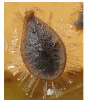
Seeds are oblong, 3mm long, and surrounded by tiny, transparent hairs